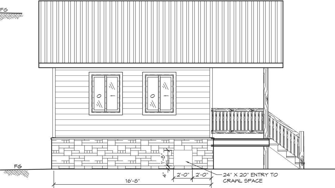
2 WEST ELEVATION SCALE: 1/4" = 1'-0"