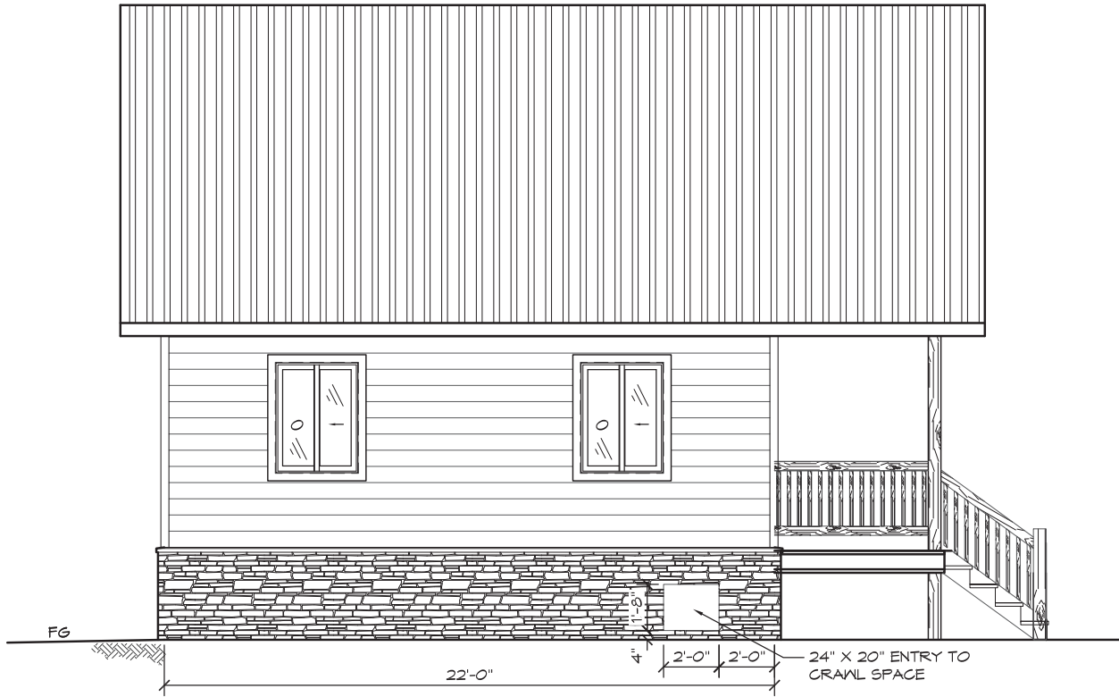
1 WEST ELEVATION SCALE: 1/4" = 1'-0"

NOTE: SIDING IS OPTIONAL, THERE ARE MANY SIDING OPTIONS TO CHOOSE FROM